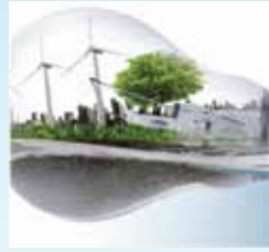
Flexibility Working Group