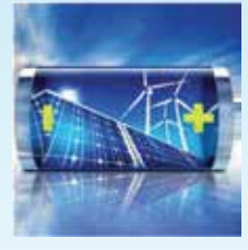
Power Grid Electrical Energy Storage Work Group