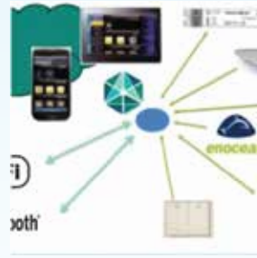
Interoperability And Standards (IWG)