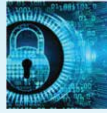
Cyber Security Working Group