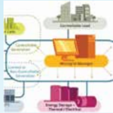
Microgrids Working Group