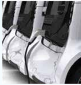
Interfaces Of Grid Users/ Focus On EV And Local Storage (GUII)