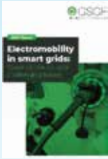
Electromobility in Smart Grids: State of the Art and Challenging Issues